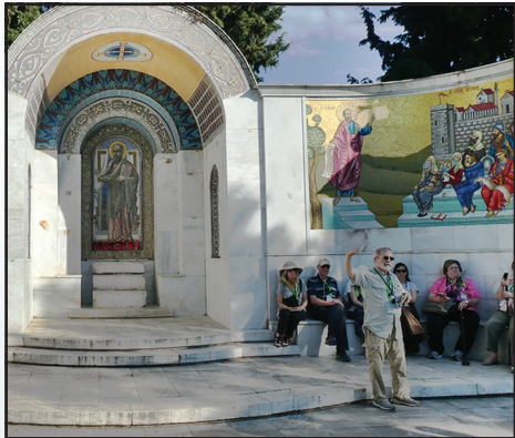
Altar of Saint Paul at Berea

The cruise line offers a couple of excursions including a full-day tour to the Meteora Monasteries. (B, L, D).