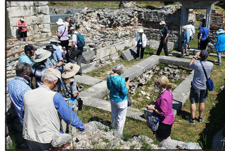
Baptistry in Ancient Philippi

There is a lot to see in Thessaloniki including the Roman Agora, the Arch of Galerius, and the White Tower. (B, L, D)