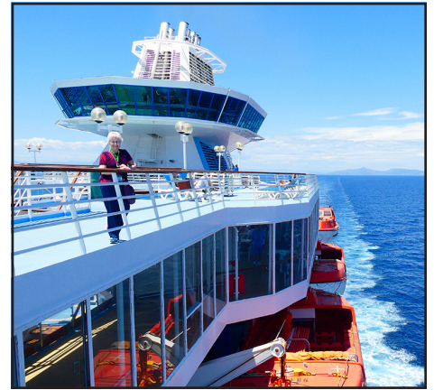
Cruise on the Aegean Sea

about what impacted you the most, and focus on how your faith has been strengthened. (B, L, D)